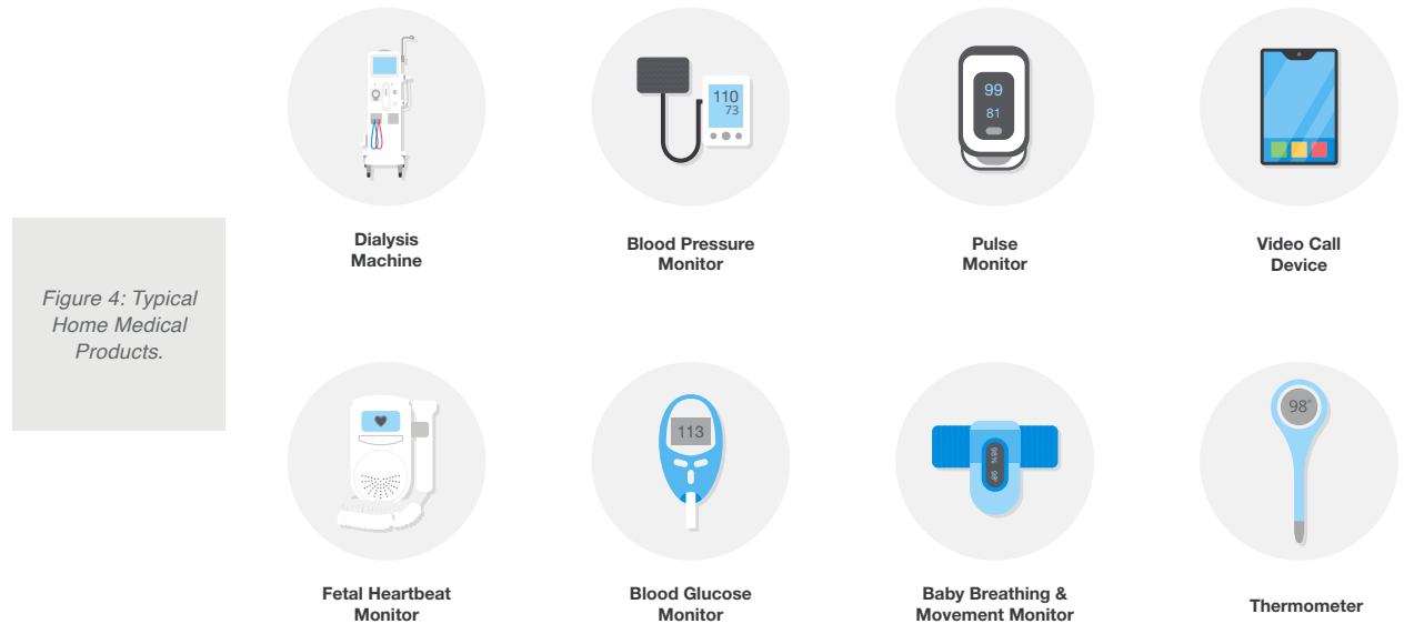
Figure 4: Typical Home Medical Products.

It will also no longer include the “life-supporting” equipment category. What prompted these changes is that it is becoming harder to define what qualifies for that category as more medical equipment gets installed in environments that are not hospitals, including dental offices, homes, and factories.