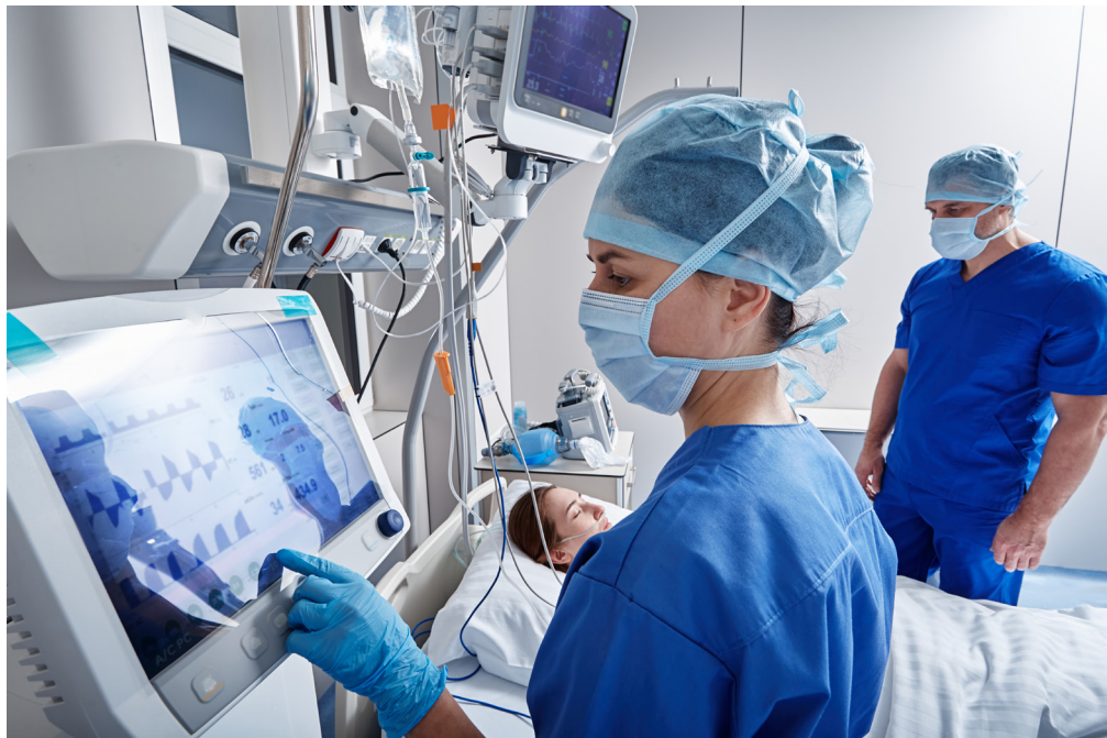
Figure 2: Medical Staff Using Electronic Equipment.

The voltages and currents provided by both ac-dc power supplies and dc-dc converters means there is an inherent hazard if not properly managed.